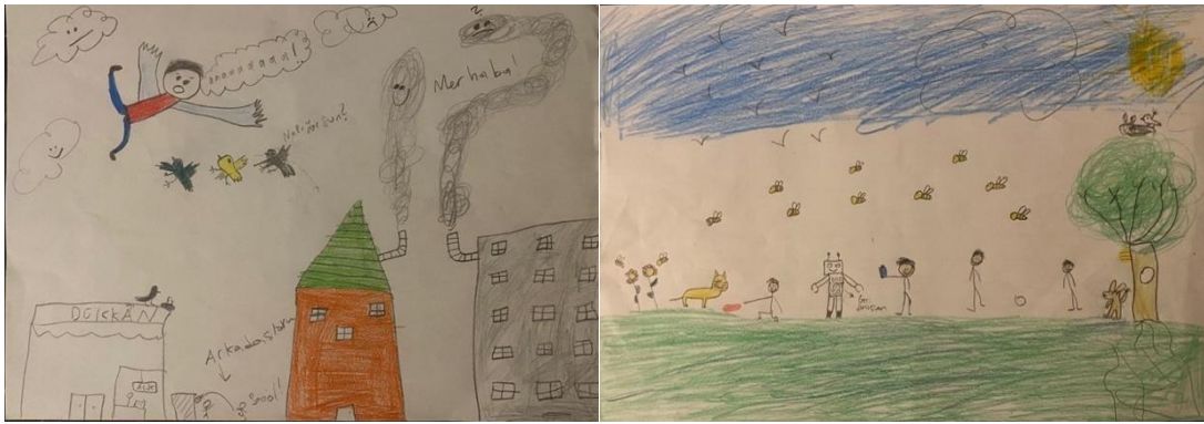
The first drawing drawn by S1