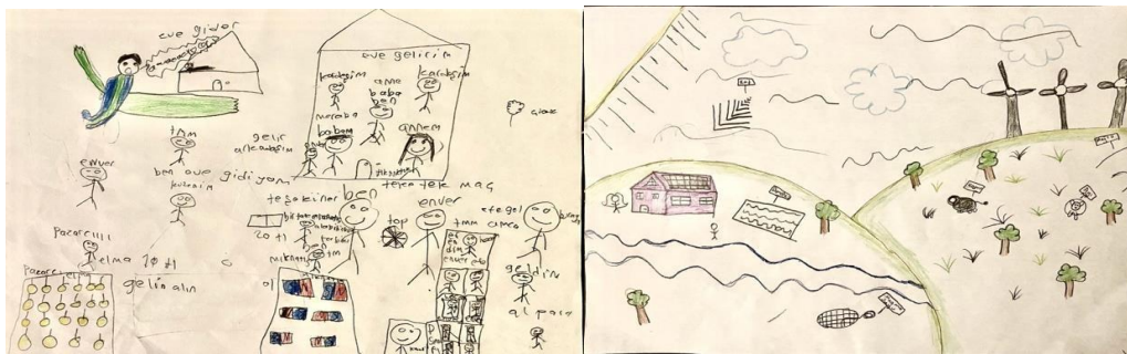
First drawing drawn by S12