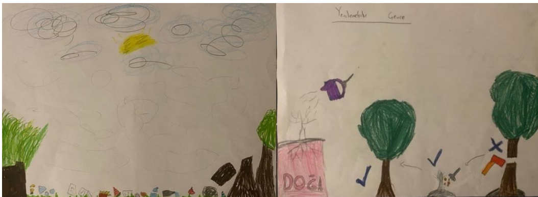
First Drawing by S9

S7 explained his first drawing as follows: "In my drawing, I talked about things like environmental pollution and violence against animals, there were smoke coming from the factory and fog coming from the environment. And they throw the rubbish on the ground instead of throwing it in the rubbish bin and I feel sad that the environment is bad. And there is a sun there today." TS7 explained his last drawing as follows "In my drawing, firstly, I wanted to plant trees every month, because in this way, we can live in a greener world with cleaner oxygen, then not to throw rubbish on the ground, for the world to be clean, and in my last drawing, for everyone to look at their carbon footprint and be more economical."