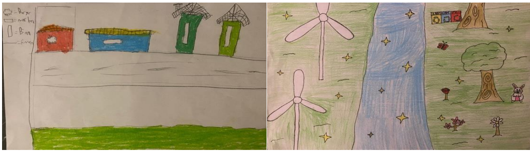
First drawing drawn by S11

S10 explained his first drawing as follows: "I thought I was a bird and drew what I saw, for example, our school, Galata tower, trees, people throwing rubbish, flowers, the sun and so on." S10 explained his last drawing as follows: "Hello friends, now I showed the life in my imagination in my drawing, a natural life would actually be very good, but in real life people are very cruel but people do not realise this, in fact, if we look at the environment very well, everything will be better."