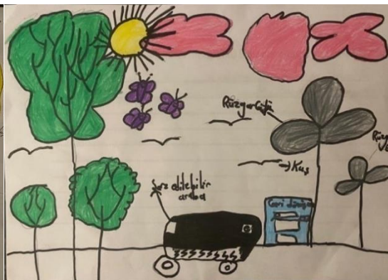
Last drawing drawn by S4

S4 explained his first drawing as follows: "The doodle in the picture is actually poisonous gases and the things on the ground are rubbish, although they are recyclable, they throw them on the ground. The squares and rectangles are houses because I wanted to draw this picture from a bird's eye view. The other small squares are chimneys and the grey things coming out of them are smoke." S4 explained his last drawing as follows: "The first thing I want to show in this drawing is how different the picture of waste and environmental pollution and my imagination are. Throw 1 rubbish into the thing you see in my picture with the word recycling on it and type its old form on the keyboard and it will come back in its old form again. In this picture butterflies and birds are flying and having fun. Cars get energy by charging and this energy is wind energy. The sun always rusts and rises bright yellow. The people living here are filled with happiness. Trees are always green. Sometimes they shed leaves. This is how life goes on here."