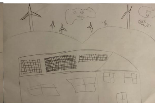
Last drawing drawn by S5