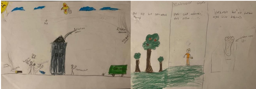
First drawing drawn by S7

S5 explained his first drawing as follows: "The environment I see when I leave school on a normal day is a normal environment but it is very active. It is an environment with noise pollution, so there is a lot of noise pollution, and someone honks the horn to get people to move away because of the crowd." S5 explained his last drawing as follows: "We humans should live regularly. They should use the new natural world as it is, they should not emit exhaust, cigarette smoke or very little. They should not release factory smoke to nature. Let us live the Earth, not the Earth us. Nature is ours and we are our nature. I wish we could live life more naturally. Yes, I know that needs do not end, but resources end one day. Life offers us a chance, but we want it, but if we can make use of our first and last chance, everything will be very beautiful. I tried to make a picture that tells this."