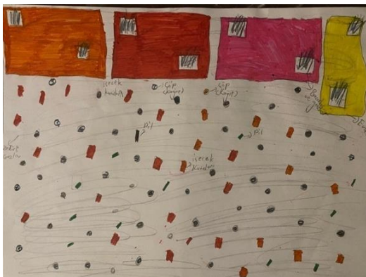
First drawing drawn by S4

rubbish on the ground instead of throwing it into the rubbish bin or recycling. What is explained in this picture is that please people should protect and beautify nature and finally I would like to add that living creatures do bad things by causing noise pollution." S2 explained his last drawing as follows: "I used a lot of colours in my drawing. I will mention the following about my drawing: I used things that look like wind roses to create wind energy in the picture. I also chose a tree and grass as greenery. My tree is a banana tree. And to add colour to the painting, I drew and painted a blue sky without white spaces instead of clouds. And never missing flowers, I drew lots of flowers and an apartment building. The apartment even has a name: I drew a rose next to the rose apartment... That's it..."