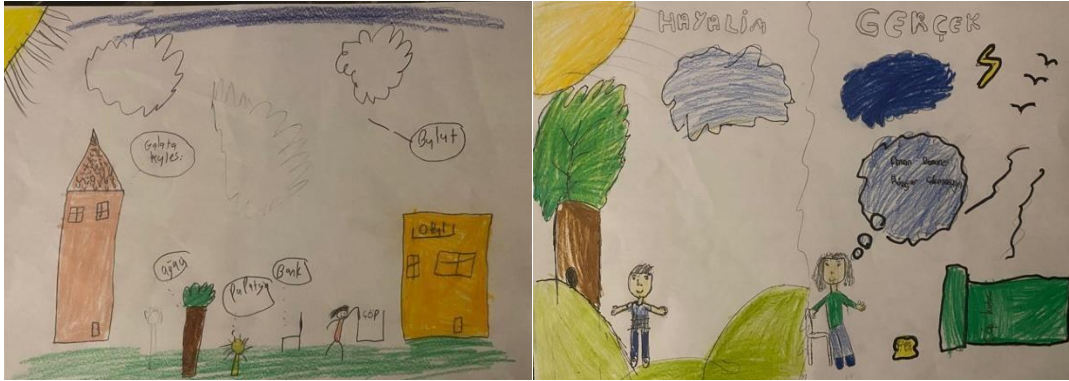
First drawing drawn by S10

sometimes, it has started to happen all the time, so we should take good care of our nature and protect it well." S9 explained his last drawing as follows "In the picture I drew, I drew the replanting of the cut trees and planting a lot of plants in the nature. We should take good care of the nature because a lot of trees are cut down even in a day, so trees should be replanted in the places of the cut trees and they should be watered regularly and they should see the sun to grow. Therefore, we should protect nature."