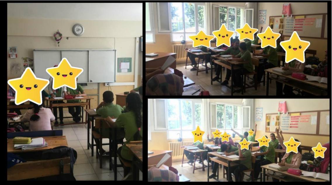
Photographs 3. Photographs from the Panel Application in the Experimental Group

In Week 3, while the lesson was being taught in the experimental group, the contrast panel technique was applied and the following achievements were aimed to be acquired by the students.