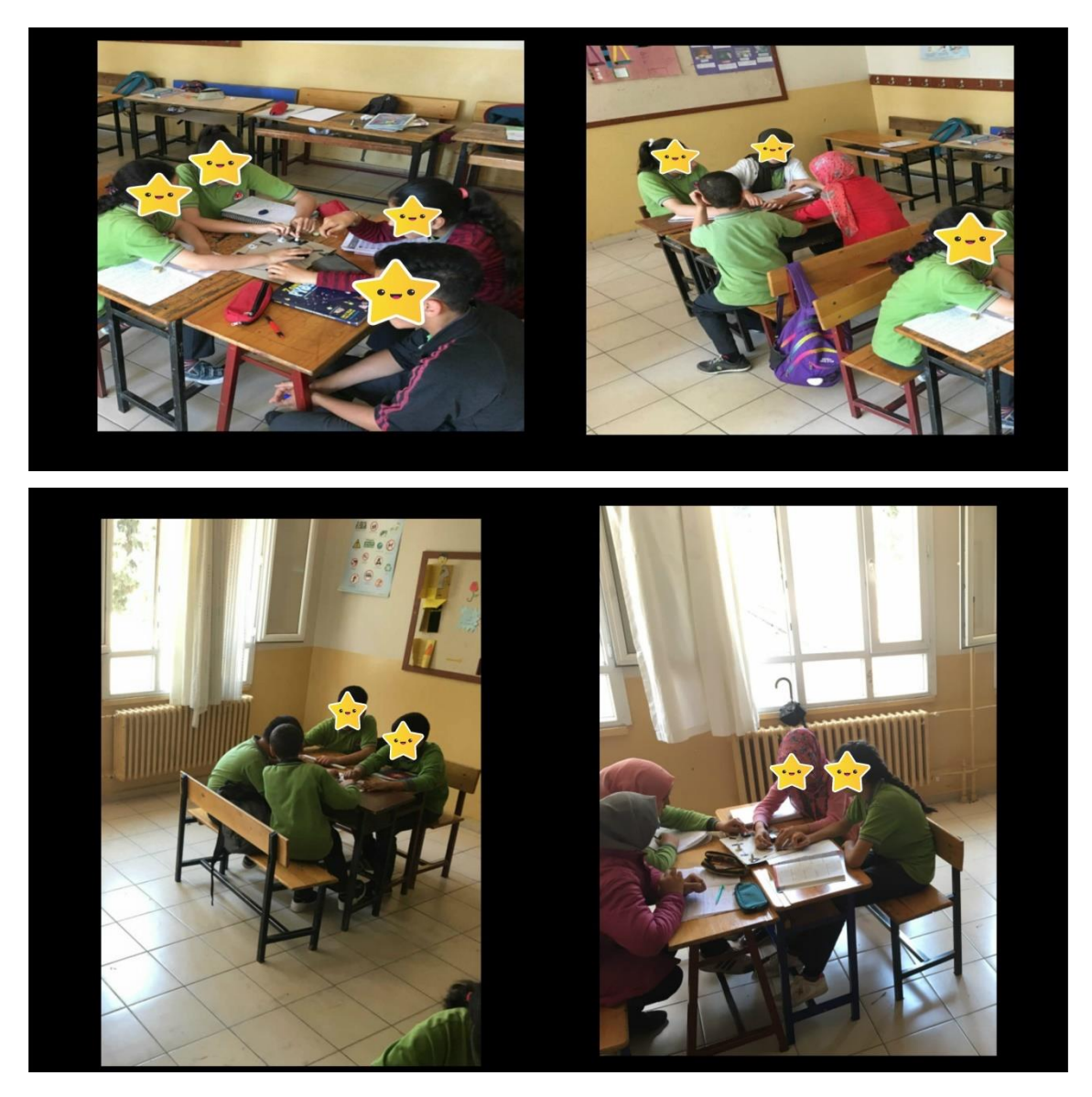
Photographs 2. Photographs from the Small Group Discussion in the Experimental Group In Week 2, the panel technique was applied during the lesson in the experimental group and the following achievement were aimed to be acquired by the students.

Achievement 3. "Predicts the variables on which the brightness of a light bulb in an electrical circuit depends and tests his/her predictions by experimenting."