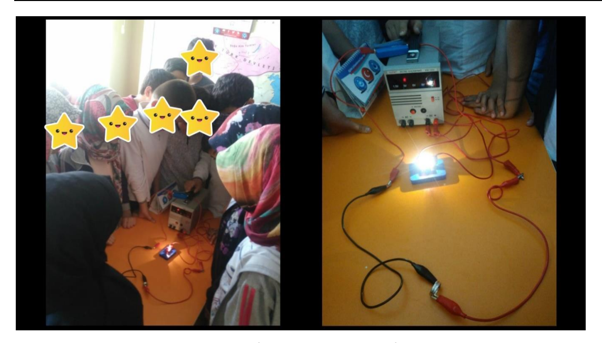
Photographs 1. Photographs from the Activity Study of the Control Group Students

In the experimental group, the lesson was taught using the techniques of the discussion method within the unit achievements.