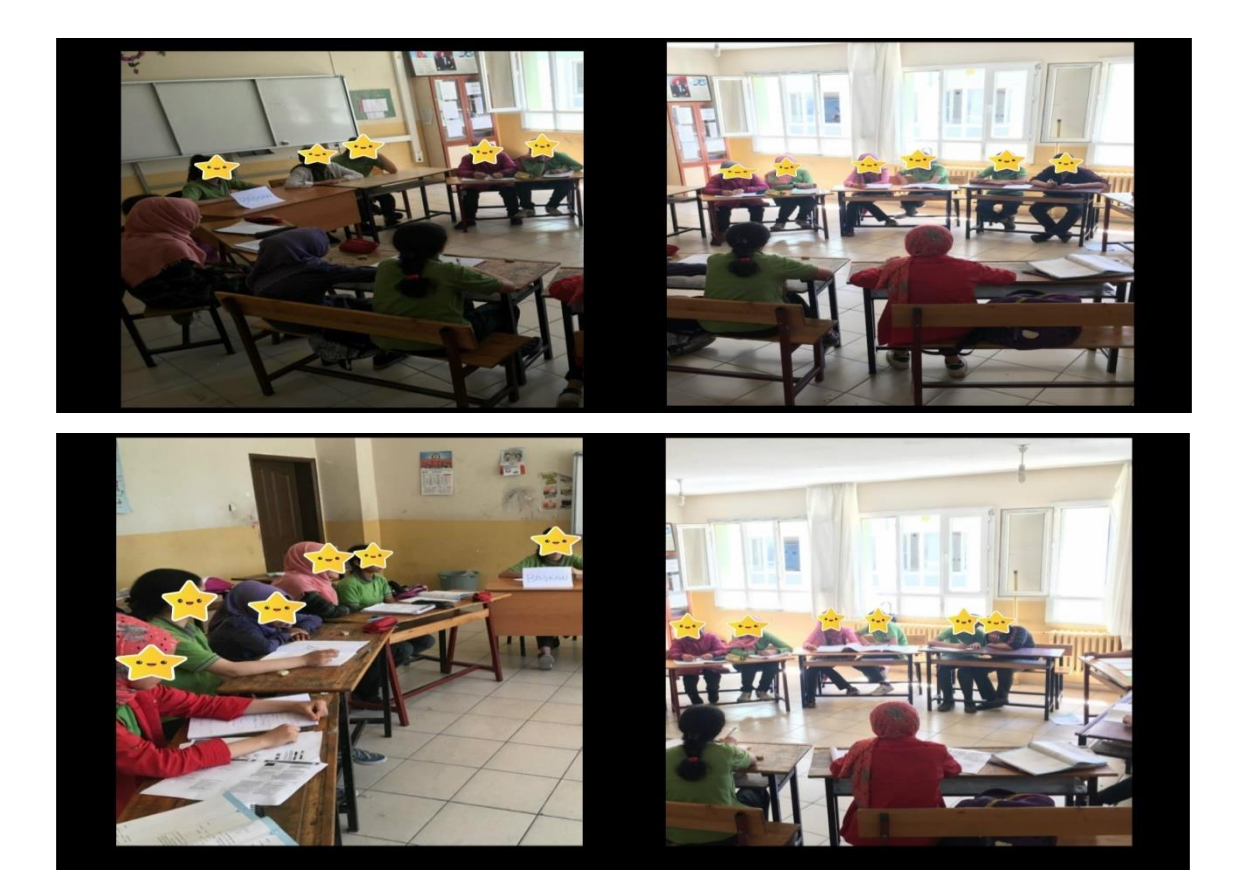
Photographs 5. Photographs of the Circle Technique in the Experimental Group

In this lesson, the topic of electrical resistance and the fact that a light bulb is made of a conductor wire and has a resistance was covered. When this topic was taught, the circle technique was applied. Before applying the circle technique, the students were seated in a circle and a leader, a secretary and a timer were selected among them. Thus, starting from the right of the leader, each student was allowed to talk about the topic for two minutes. After each student had spoken, all students participated in the lesson. The circle technique was practiced with the leader. When questions were asked and answers were given, the secretary took notes of the questions and answers. Photographs of the circle technique are given below.